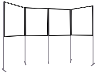
4 panel optional headers available Panels size: 1000mm x 1000mm Pole Diameter: 16mm top, 50mm base